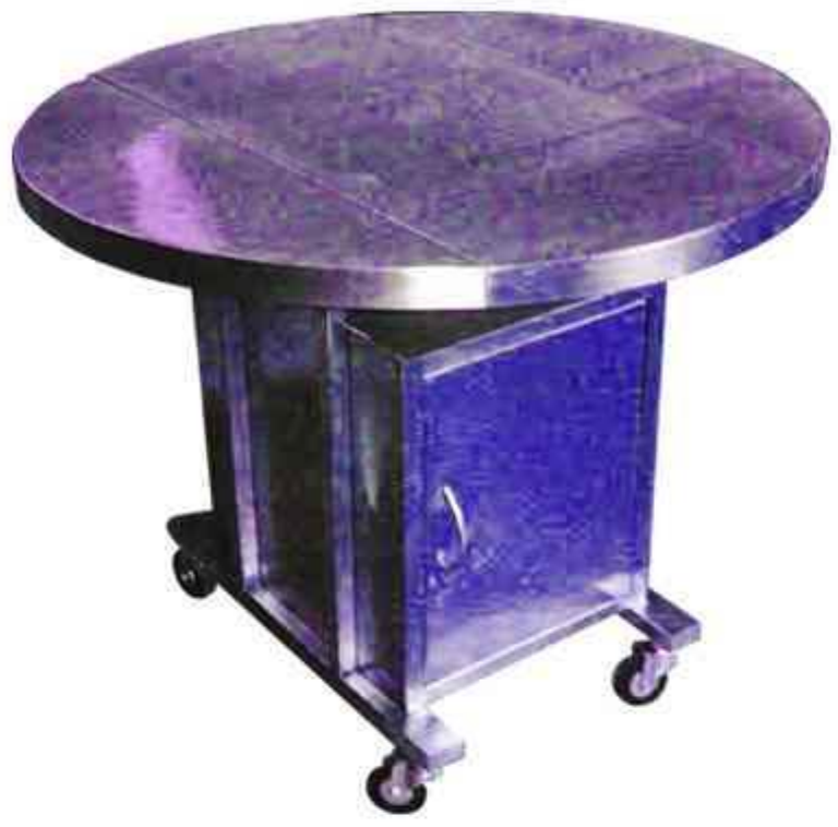
Room Service Trolley