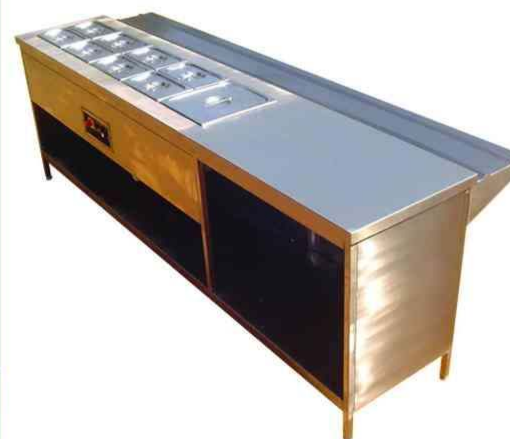
Bain Marie Counter