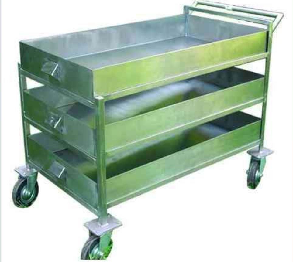
3 Shelves Trolley