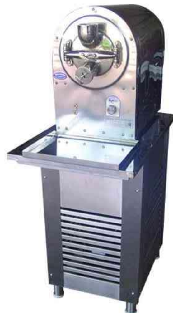
Ice cream Churner