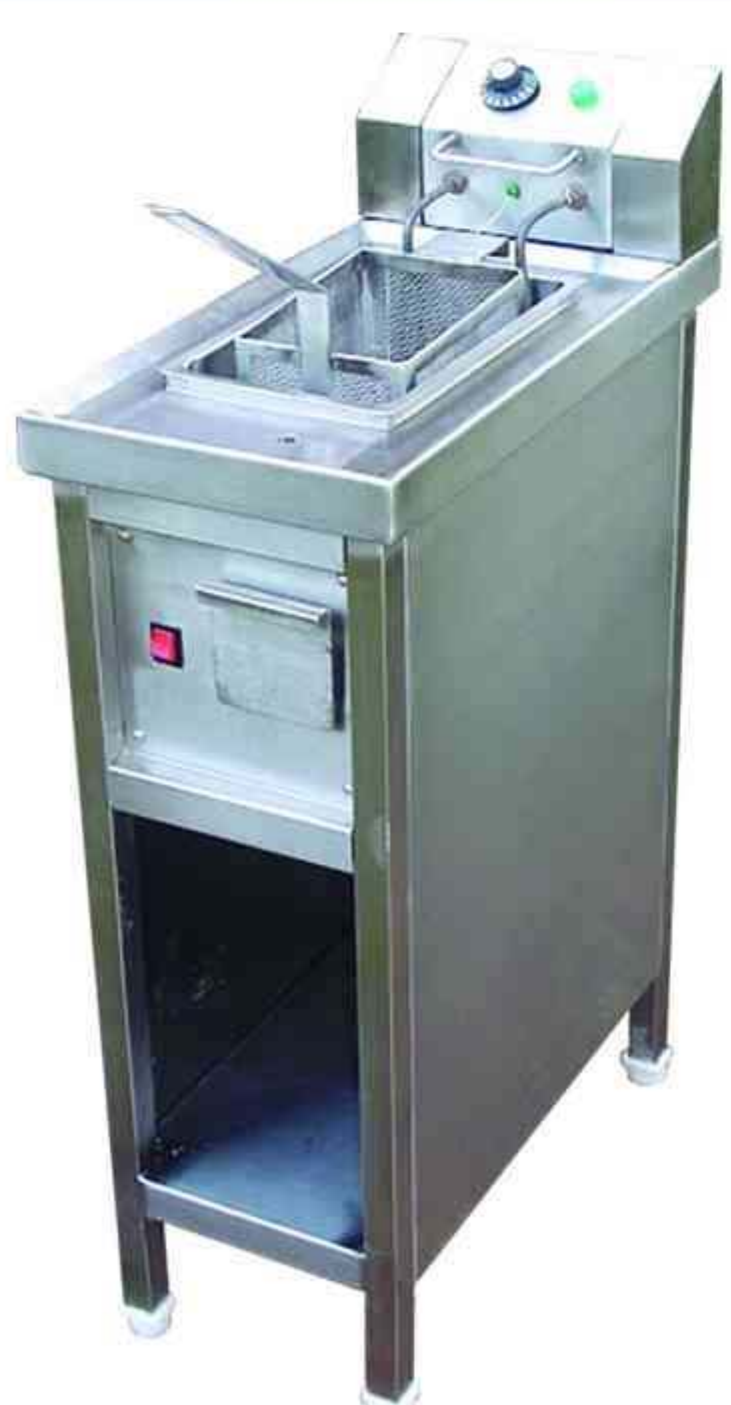
Deep Fat Fryer