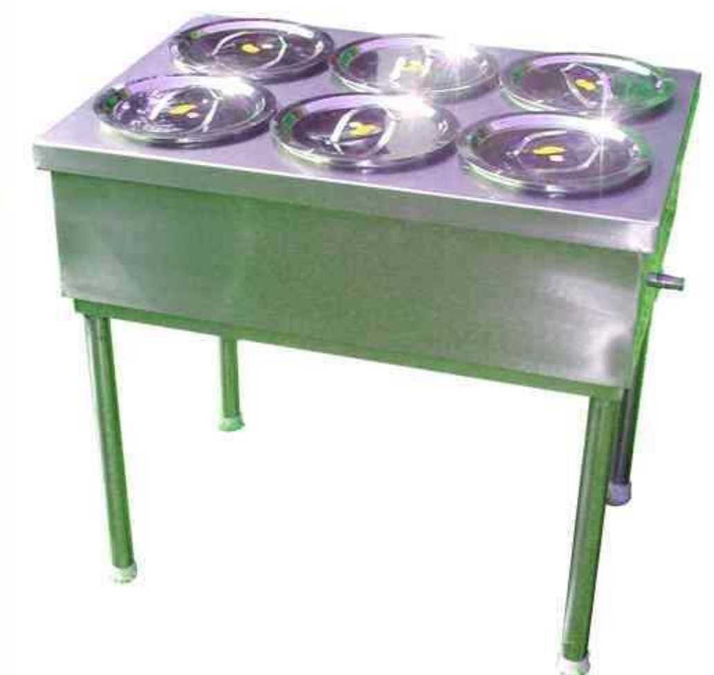
6 vessel hot case