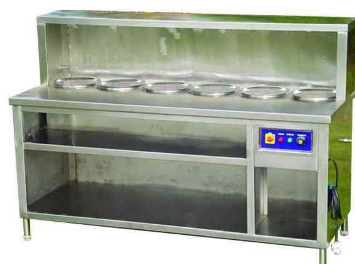
Bain Marie Counter