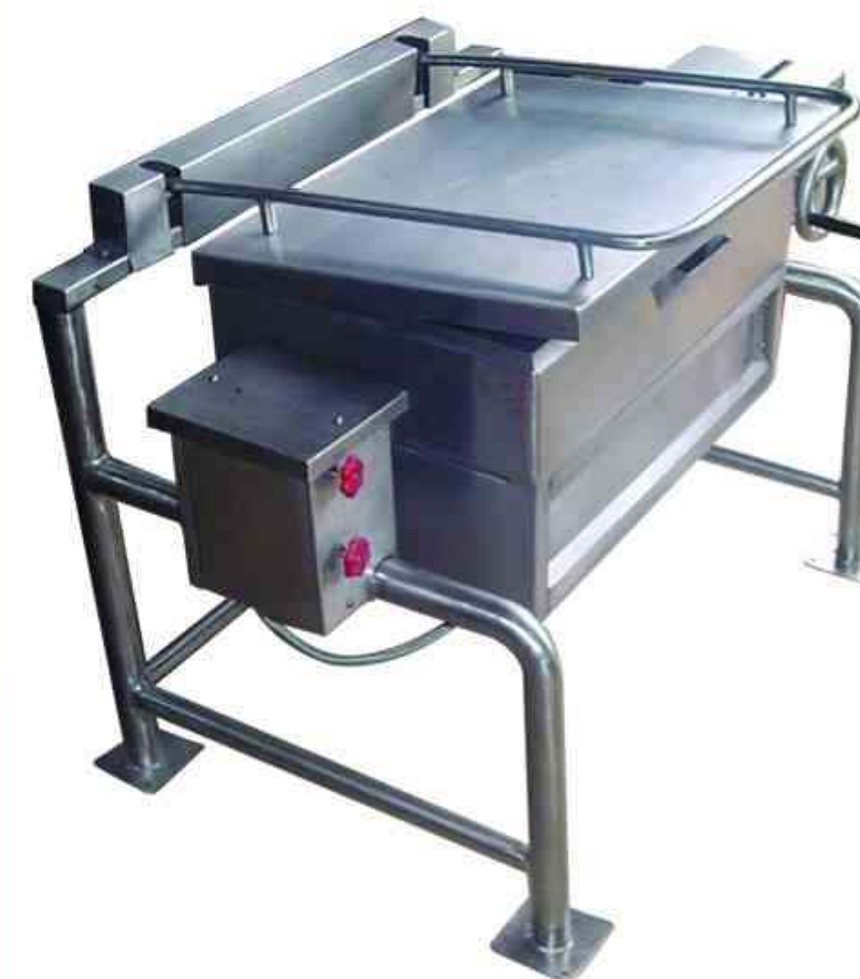
Tilting frying pan