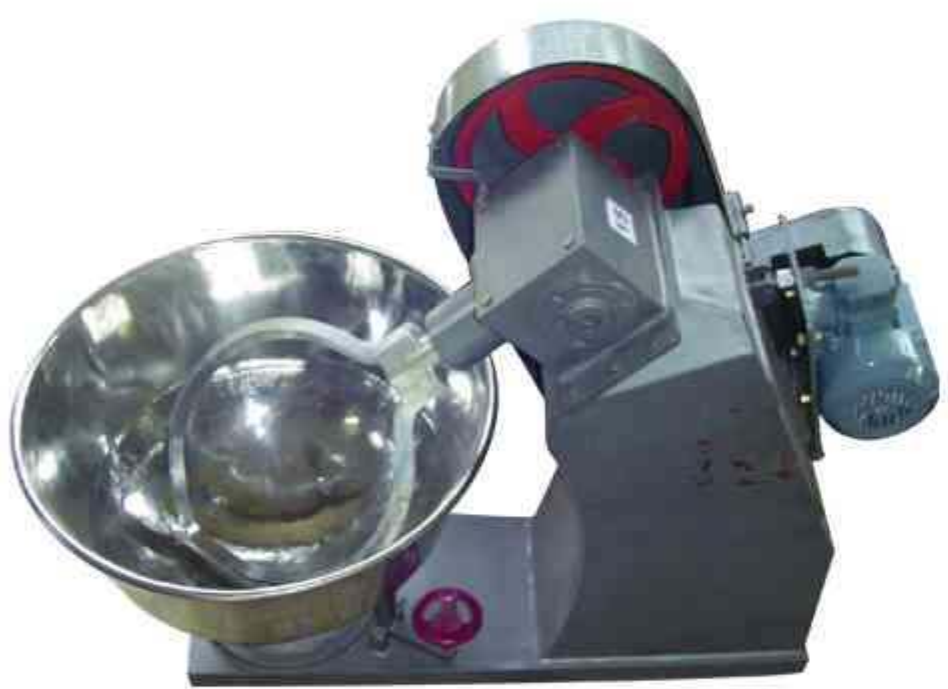
Dough Kneading machine