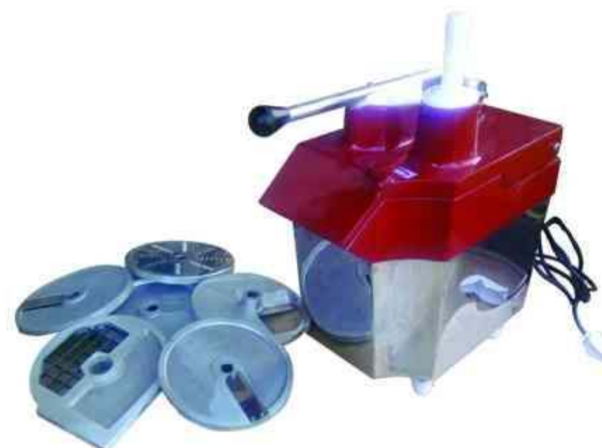
Vegetable Cutting Machine