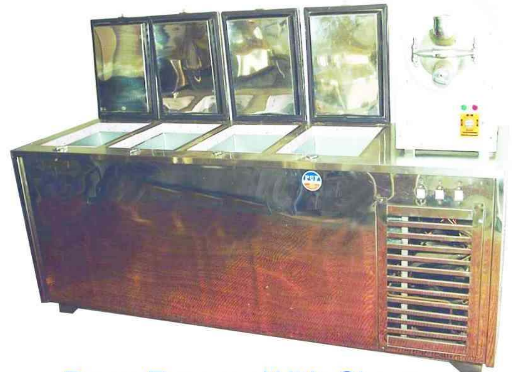
Deep Freezer With Churner