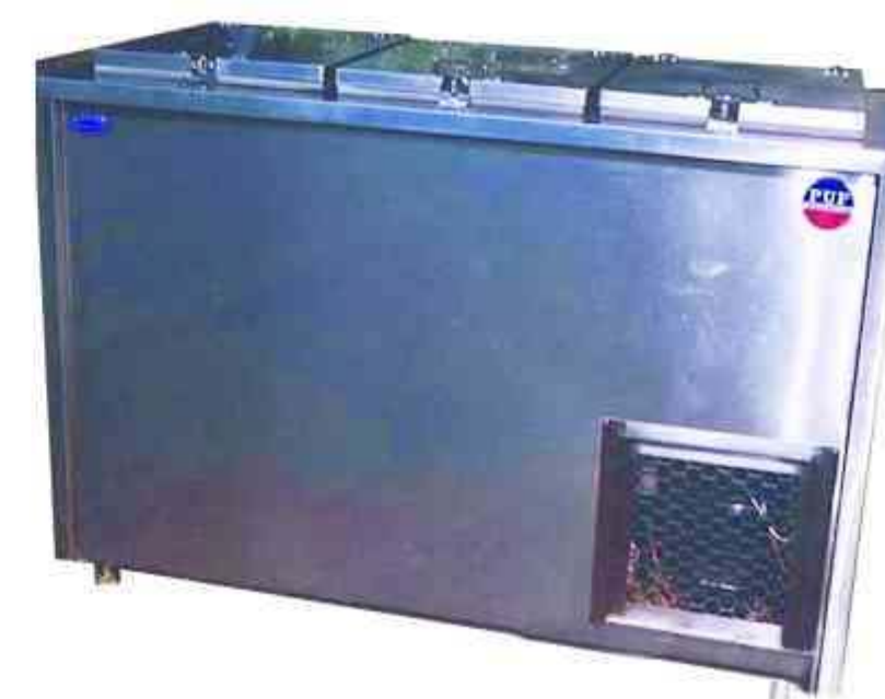
Deep Freezer / Bottle Cooler