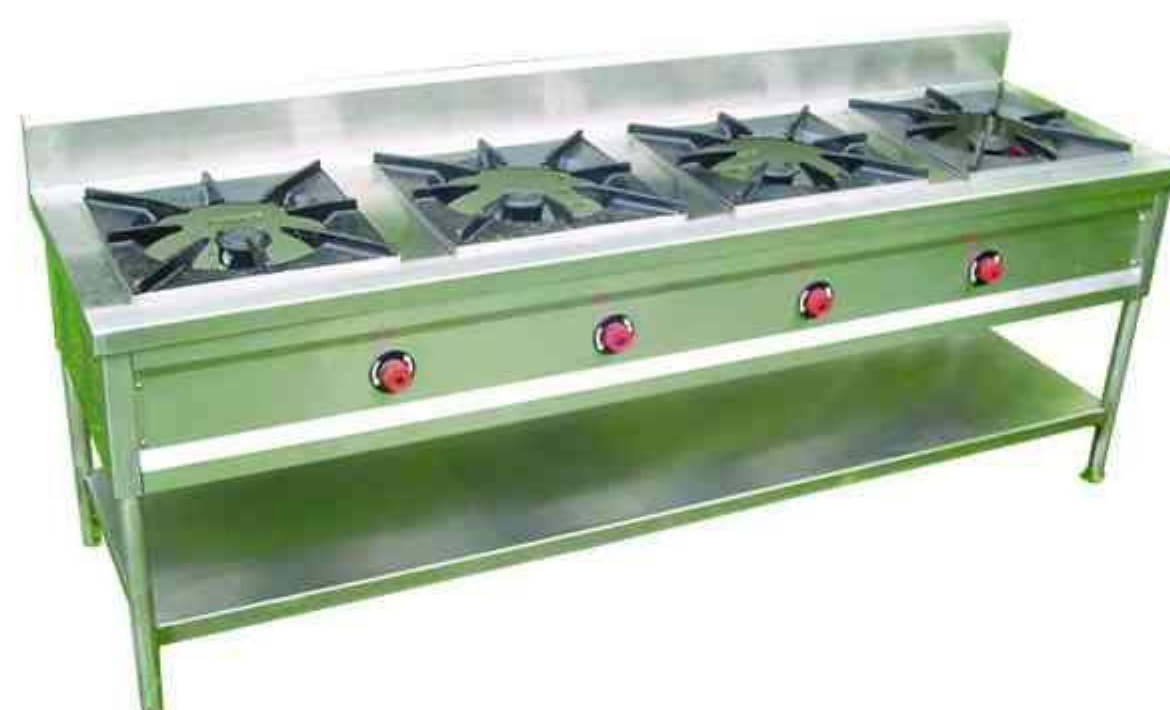
4 Burner Cooking Range