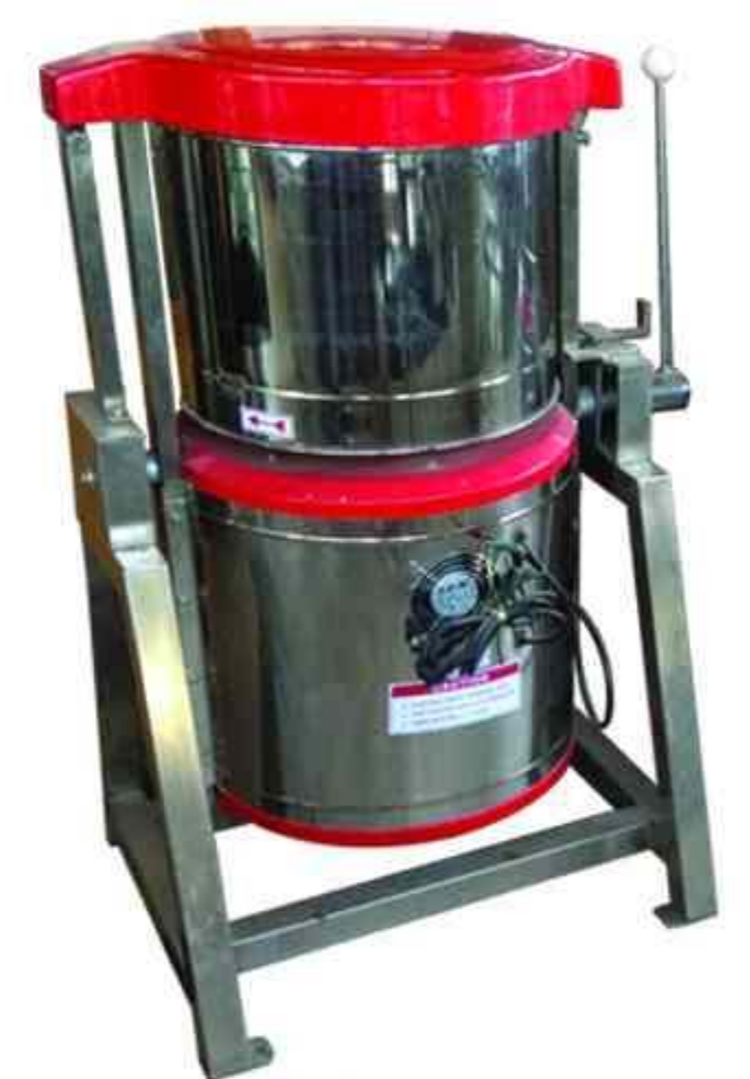
Tilting Wet Grinder