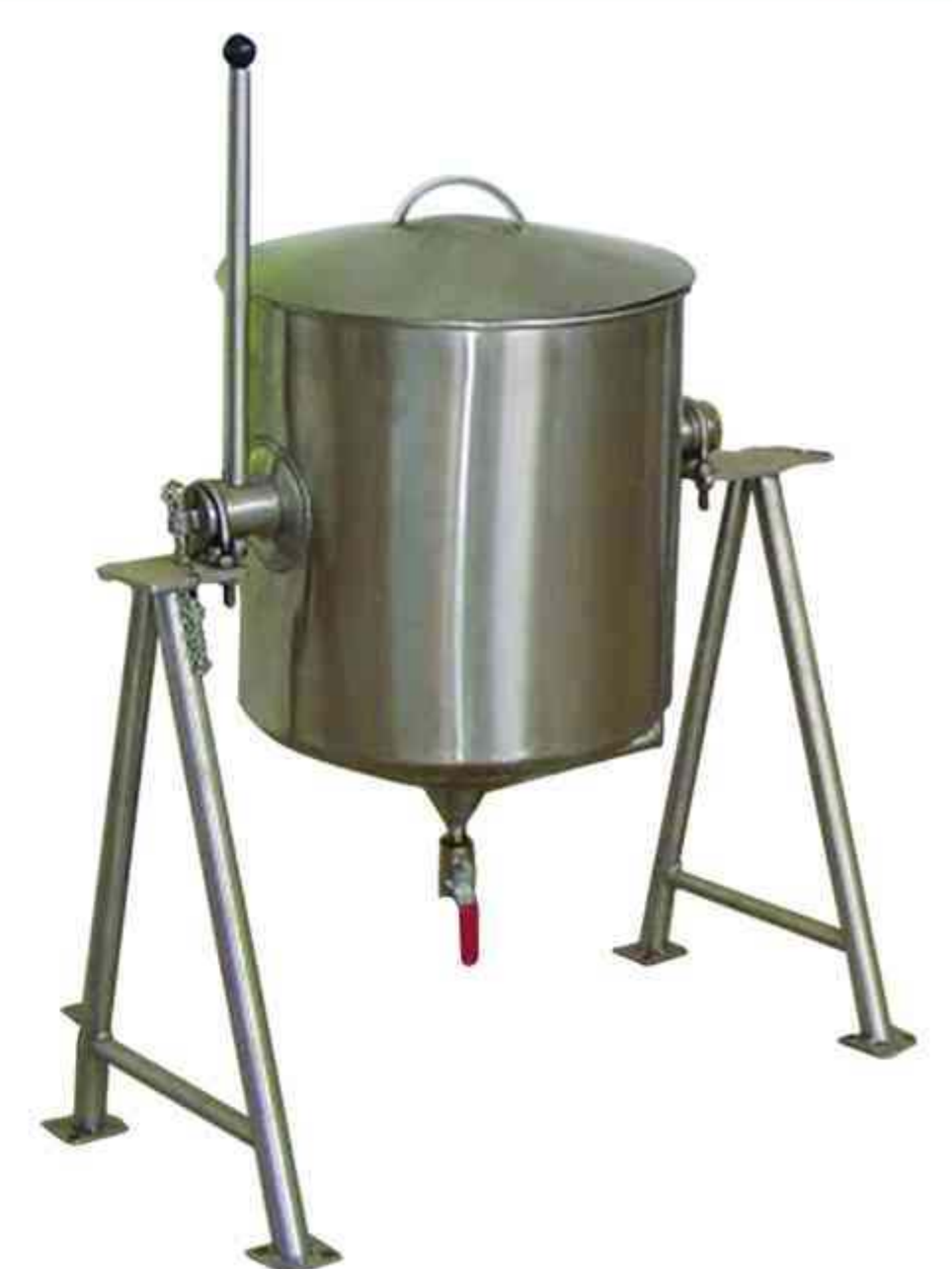
Cooking Vessel (Steam)