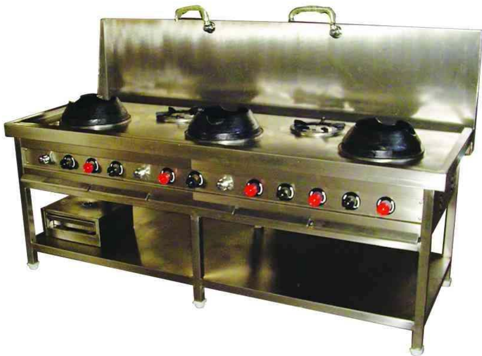
Chinese Cooking Range