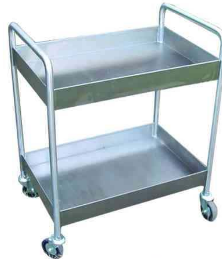
2 Shelves Trolley