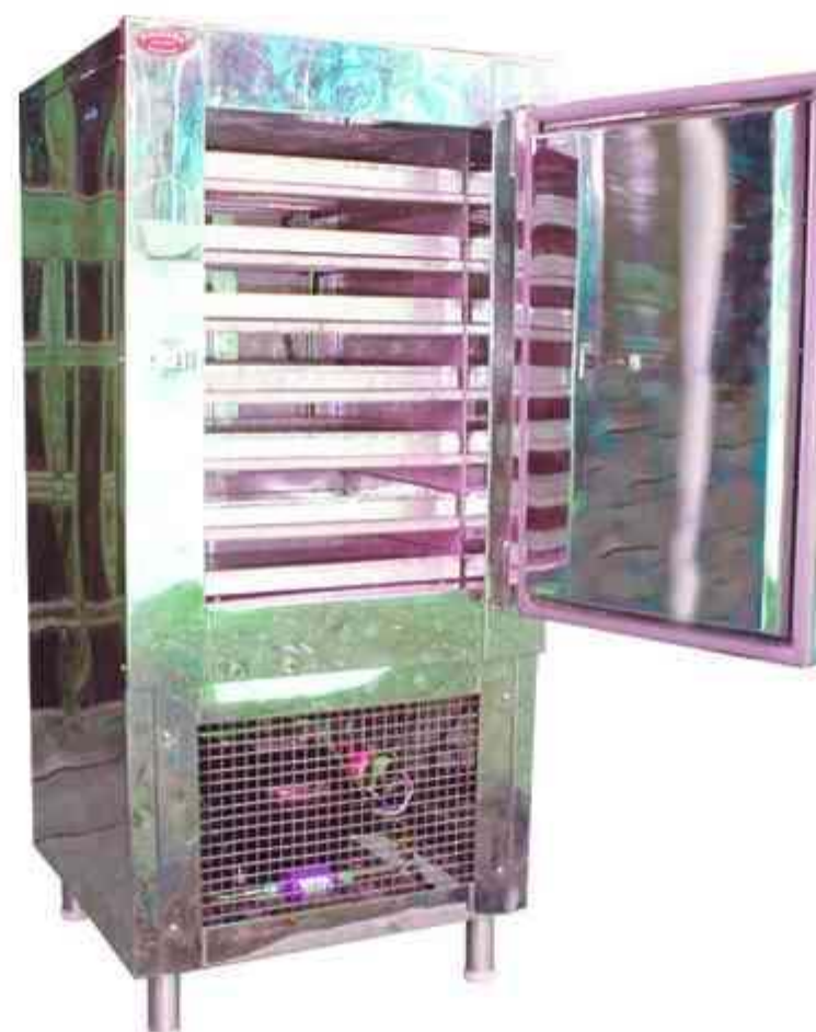
Ice Cream Hardner