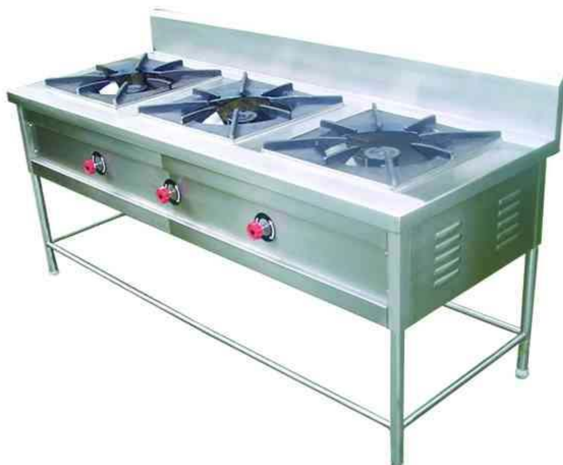
3 Burner Cooking Range