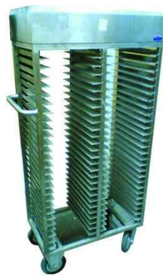
Plate Stacking Trolley