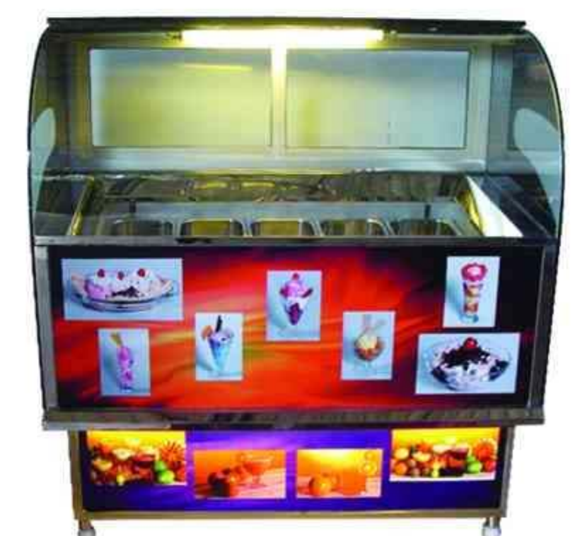
Ice cream Display Freezer