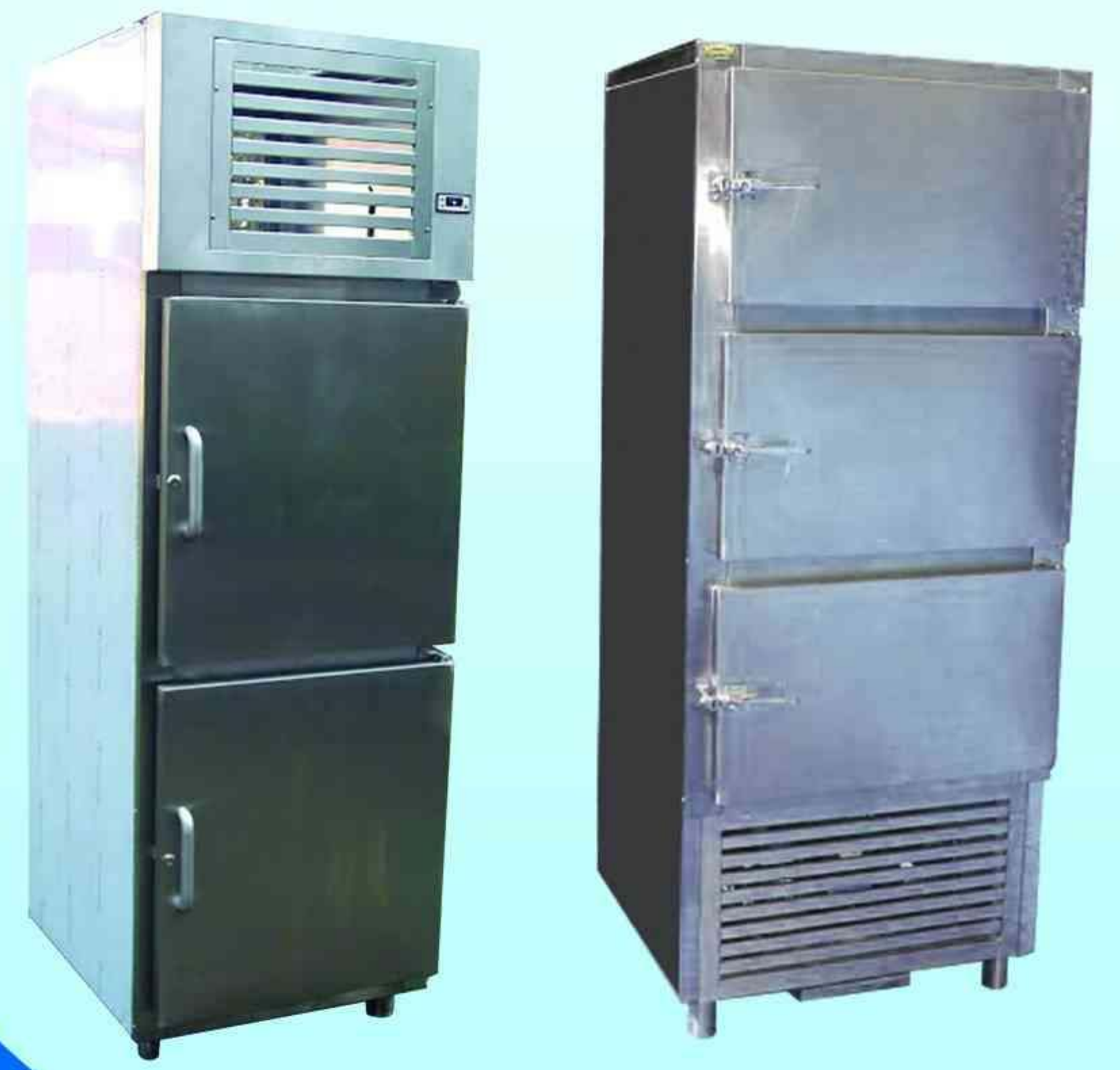
Reach in Cooler / Freezer