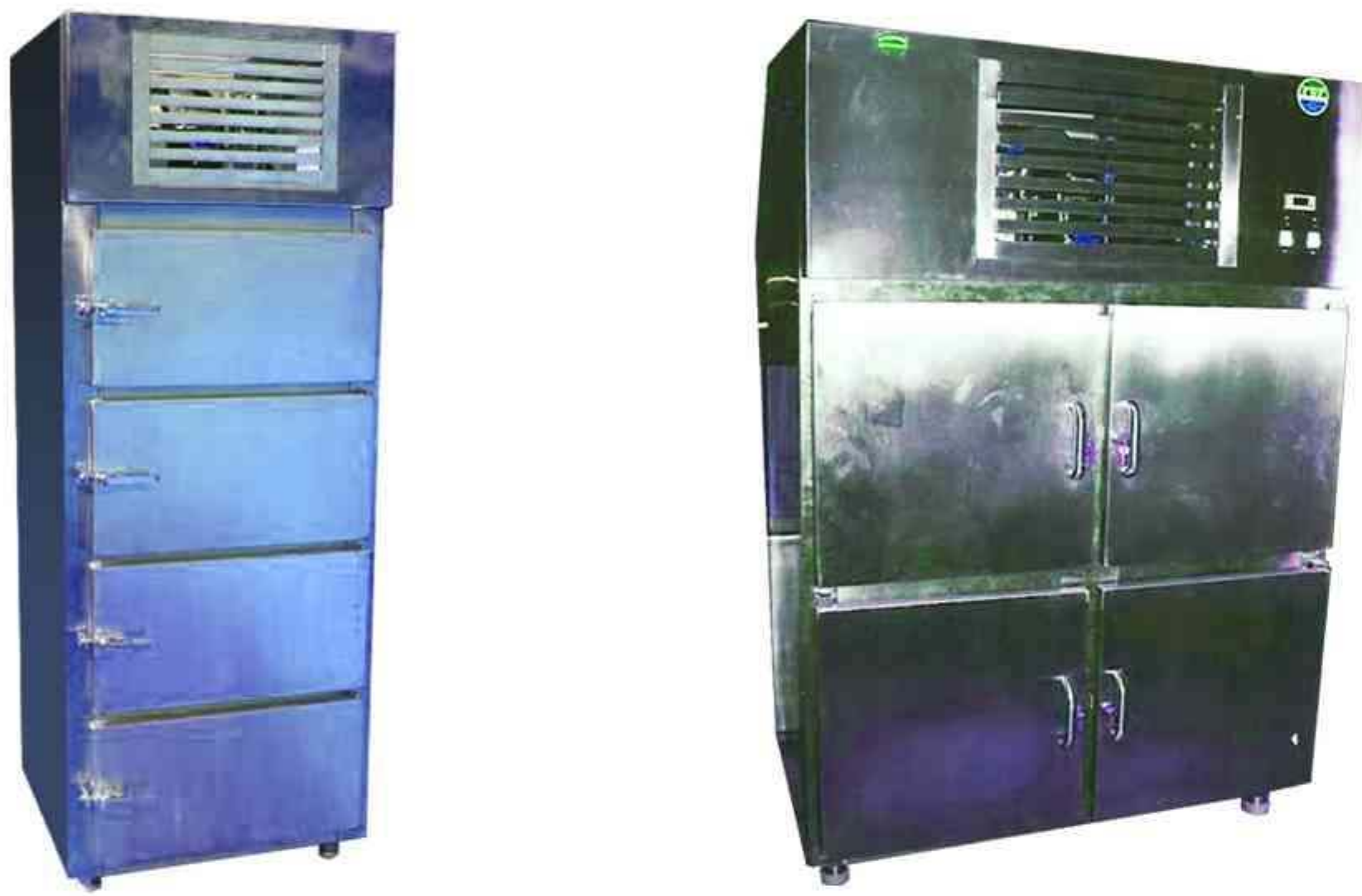
Reach in Cooler / Freezer